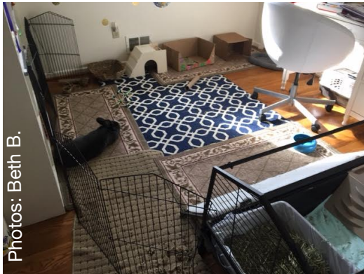
Blue in her bedroom.

We are so in love with our Blue that I am compelled to share her progress with FoR! We adopted her on Oct. 26, 2017. We did not want to keep her in a cage so we gave her the entire spare room that we had in our house. It gets tons of afternoon sun and she loves to take sun naps. She has her area for her litter box and fresh water, but has the entire bunny-proofed room for roaming. Despite having a wood desk in the room she never once chewed on it. She is a perfect angel. We added a radio to her room and on most days we have WETA on for her. We don't bother her on Saturday afternoons: That is when WETA's "Saturday at the Met"