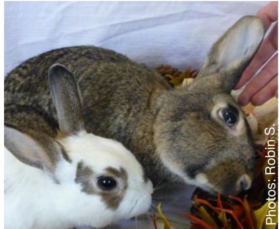
Head tilt in rabbits looks scary, but is a manageable condition.