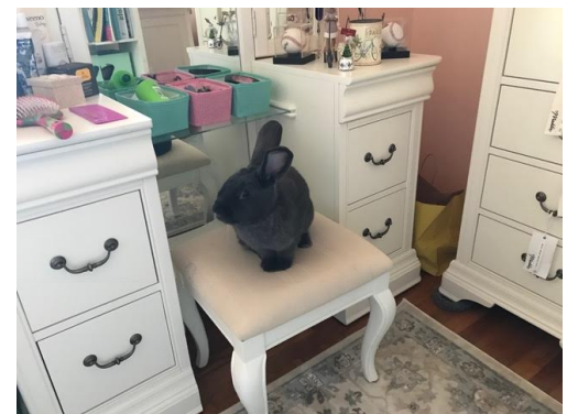
Blue, awaiting her grooming.

Our daughter, Blue's mom, joined the Virginia 4-H Youth Development Program in Fairfax. We attended our first meeting in January and took Blue to her first event in February: Club members took their rabbits to a homeless shelter in Fairfax so the kids at the shelter could interact and learn about rabbits. Since it was her first event (and the volume in the room was quite high with excited children!) we kept Blue in her travel cage. We opened the top of the cage and they could gently reach in and pet her. She did an amazing job. She was an incredible angel! One child told our daughter, "I've never pet an animal before." That comment alone was worth the hour spent here and enough to give both of us pause to remember how fortunate we are to have Blue and our two dogs. In March, Blue and the two of us attended a 4H club event at the Burke Library. All of this will culminate with the 4H Fair at Frying Pan Farm Park in August. We will keep you posted! Maybe her name will be changed to "Blue Ribbon Blue!"