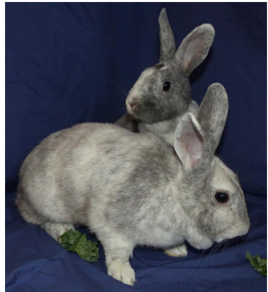
Marigold and Dandelion

It all started when the staff at the Nevada state-run Desert Willow Treatment Center released a pair of pet rabbits on the grounds. They thought the rabbits would be “therapeutic” for the youth there. There was just one problem - they did what rabbits do. They bred, and bred, and bred. It wasn’t long before 800 to 1,000 “domestic feral” rabbits were living on the center’s grounds. Overwhelmed pet-owners saw the rabbits at the site and began to follow suit, setting their bunnies “free” to survive the elements. The rabbits now overwhelm any attempt at government control, digging up public property, chewing on pipes, and ending up dead in the sewers. To survive, they depend entirely on the kindness of self-identified “bunny-lovers” - volunteers like Stacey Taylor and Dave Schweiger of Bunnies Matter in Vegas, Too and Erin Urano from Rusty and Furriends: Vegas Dumpsite Bunnies.