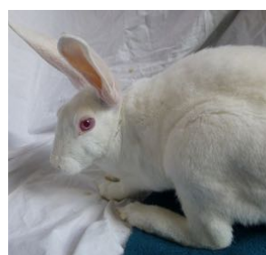
Phoebe & Page