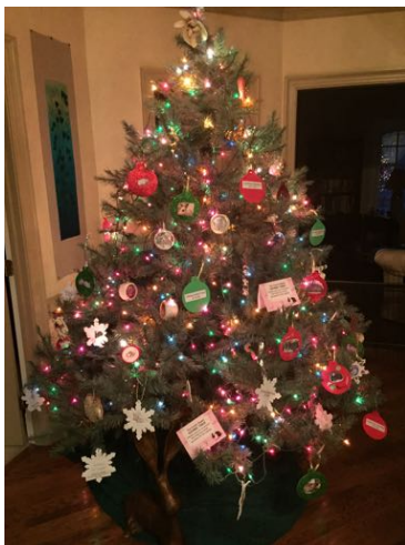
FoR's Giving Tree, a chance to give the adoptable rabbits a gift during the holiday season.