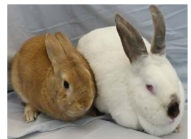
Riddique and Augustus Red. Big bunny, bigger love.